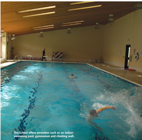
The school offers amenities such as an indoor swimming pool, gymnasium and climbing wall.